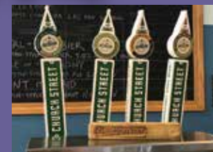
Church Street Brewery